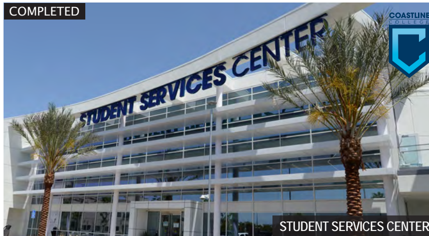
STUDENT SERVICES CENTER

Construction of a 53,000 sf Student Services Center to house Admissions & Records, Financial Aid, Veterans Resource Center, Counseling, Student Life, Marketing, Public Safety, Instructional Services, Human Resources and Administration. Students are served by a one stop front counter with staff from multiple departments in peak times of the year.